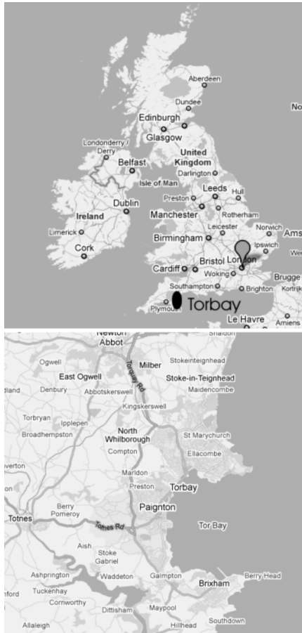
Figure 1. Cagliari (Google Maps).