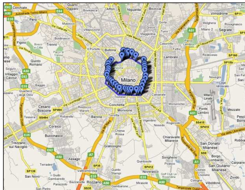
Figure 3 : The Ecopass area in relation to the whole Milan municipality territory ( www.maps.google.it )

The vehicles entering the 8 km 2 area (Figure 3) between 7:30 and 19:30 are subjected to the payment of a charge. The charging area is relatively small compared to London (22 km 2 before 2005, and 40 km 2 after 2005) and Stockholm (47 km 2 ), but it is comparable to Singapore (7 km 2 ). The choice of the location and of the dimensions of the charging area (4,8% of the urban territory and just 80.000 people) was based on the historic urban layout, rather than on accurate transport planning considerations. Therefore, despite the positive opinion on the fundamental motivations, the Ecopass area appears too small to allow a substantial effect on the transport speeds (such as the one recorded in the Stockholm case, Rotaris et Al, 2009, pg. 5) or on the local environmental conditions.